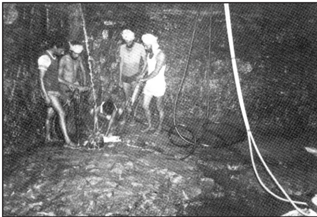
Figure 3. Rock excavation for socketing of well for pier P22 in progress

H-piles to the well from the opposite side and resting against the ring beam of the cofferdam. Kenteledge was also provided on the south-west side. Water jetting in the annular space on south-west side was also attempted to reduce friction. At one time, the contractor fixed 32-mm diameter wire rope around the well, and tied it to pulleys. These pulleys were, in turn, fixed to a winch by 32-mm diameter wire rope to hold back the north well from tilting. Further sinking by cutting rock with jack hammer was continued. Once the well penetrated in the rock strata, it was possible to dewater the well and work in open. Further sinking the well upto the required depth in the rock then became easy. 4.5m socketing of well was provided in the rock, Figure 3. As per the design requirement, 4.5-m deep socketing of the well in the rock was essential since diameter of wells was restricted to only 8 m.