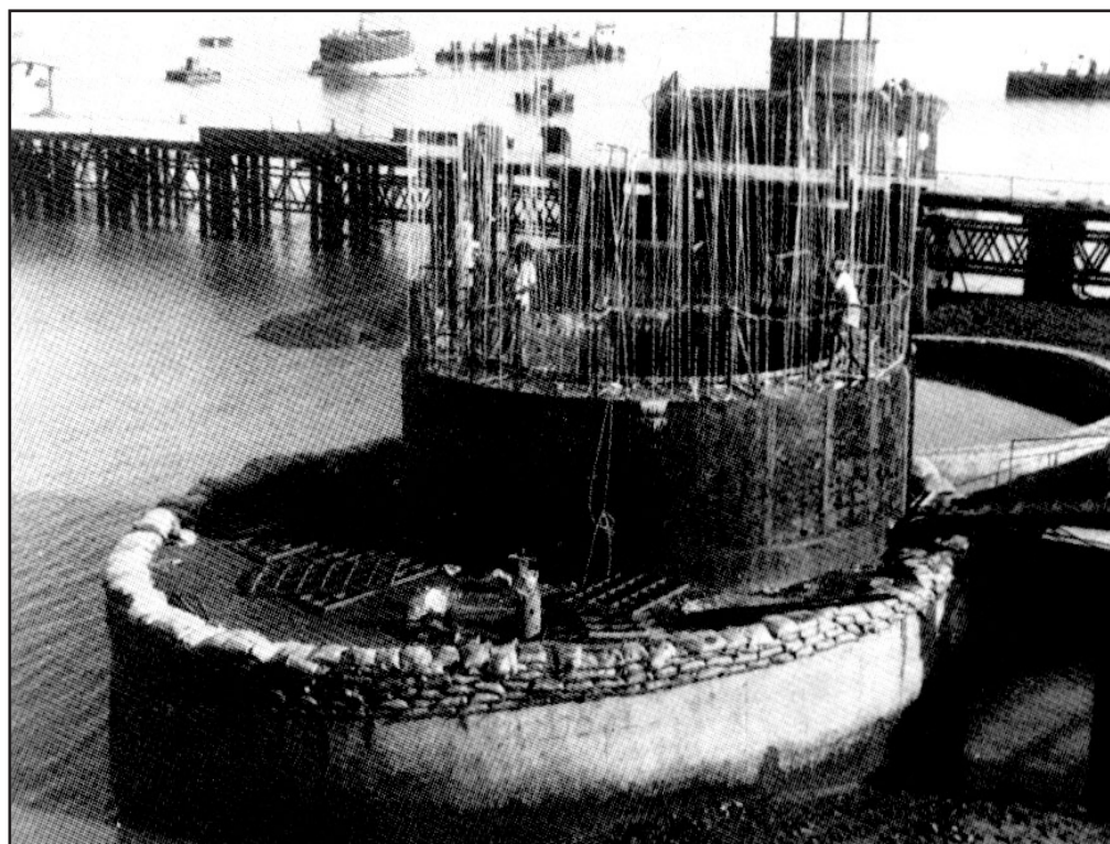
Figure 2. Cracked and deformed cofferdam for pier P22 filled with sand and stone dust. Well steining is also cast to a certain height. Tilt and shift of the cofferdam can be seen from the eccentricity of the placement of well

Due to the proximity of the north well with its cofferdam on south-west side, the cutting edge of the well got stuck over concrete ring of the cofferdam and got tilted towards northeast. It was rectified by providing 2 props of 300 x 300 mm