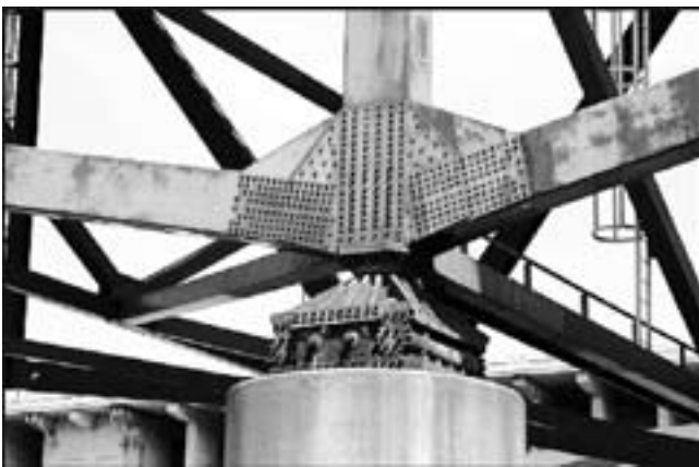
Figure 3. Corrosion of members and bearings of the I-35W bridge

Progressive Contractors Inc. (PCI) began a US$ 2.4 million project to repair sections of the heavily travelled highway, few weeks prior to the collapse. The repair was minor and cosmetic, focusing on replacing lighting, concrete and guard rails, and some work on joints. The bridge roadway slab was 230 mm thick. As part of the concrete work, the contractor milled (ground) off the top 50 mm of concrete and replaced it with new concrete. Other concrete removal work was done using 20 kg jackhammers. Nothing larger was used to remove the concrete. The most recent jack hammering of deteriorating concrete had occurred the day before