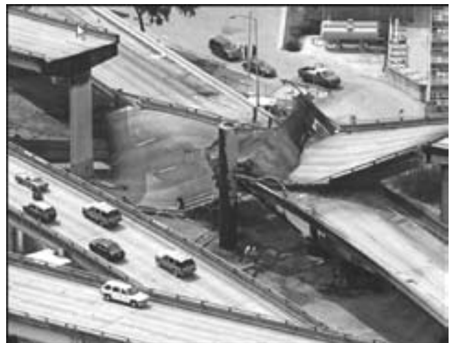
Figure 6. The San Francisco - Oakland Bay Bridge in Oakland, California, 2007

The concrete bridge in the western coastal area of Daman, about 120 miles north of Mumbai, India, collapsed, sending a school van, two rickshaws and motorcycles plunging into the muddy river. At least 25 people, including 23 children, died. After the public outrage that followed, the bridge was rebuilt by the National Building Construction Corporation, a government body, at a cost of more than Rs. 10 crore. Barely one and a half