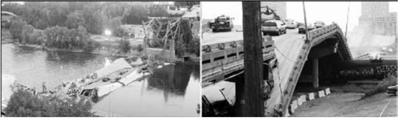
Figure 2. Two different views of the I-35W bridge failure