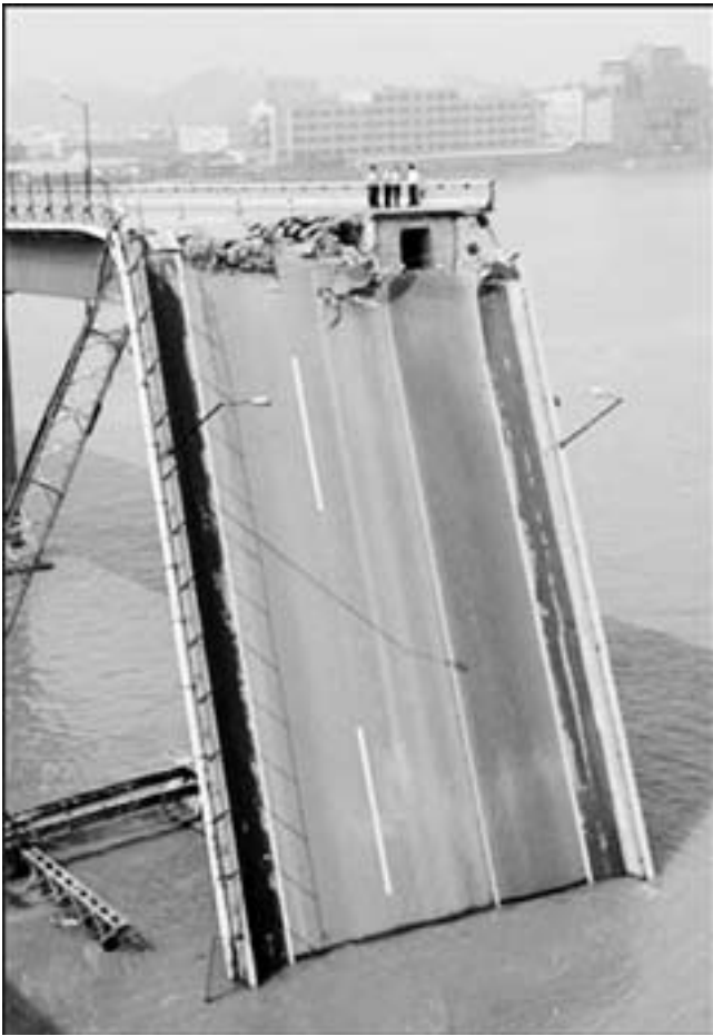
Figure 7. Jiujiang bridge in Foshan, China, 2007

months after its construction, the bridge collapsed again in August 2004 due to heavy floods!