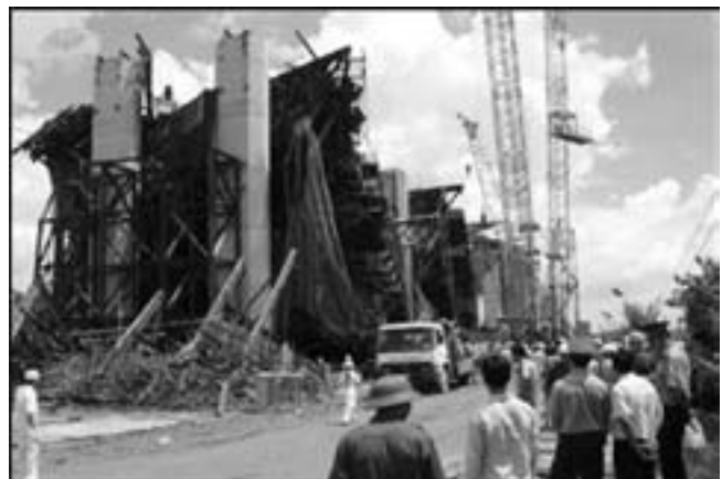
Figure 8. Bridge in South Vietnam, 2007

The Minneapolis bridge failure raise questions about bridge design as well as inspection systems. According to a six year old federal study, less than 4 percent of weld inspections correctly identify crack propagation. One potential solution is the use of piezoelectric sensors installed at potential failure points. Sensors could be wirelessly connected to monitors that would give advance warning of material or joint degradation. Meanwhile, there are scores of deck truss bridges throughout the U.S., triggering demands for immediate inspections. New York inspected all deck truss bridges soon after the failure of the Minneapolis bridge.