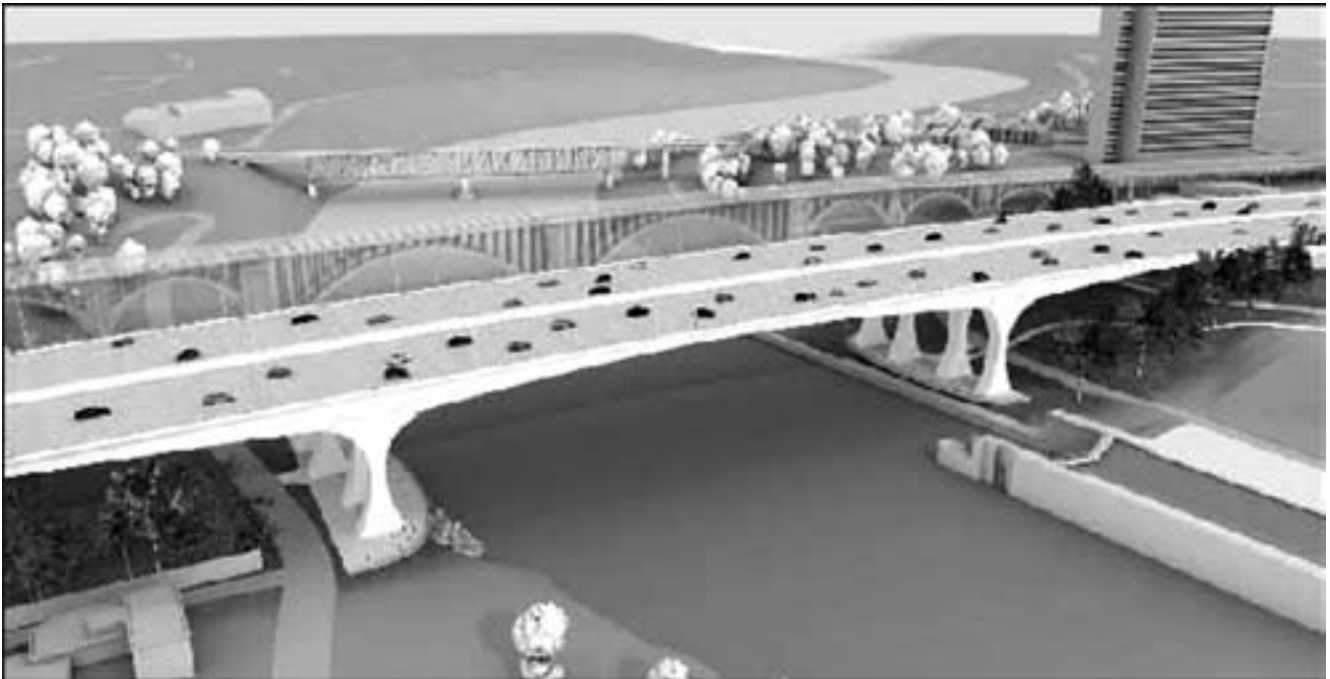
Figure 9. Artist's rendering of the proposed concrete bridge

Dozens of new technologies can help monitor bridges: X-ray machines that can spot hidden cracks in girders, computerised monitors that track minute changes in stresses on steel beams and sensors embedded in concrete that track corrosion of steel reinforcing beams. It may cost about US$ 250,000 to install a monitoring system on a large bridge.