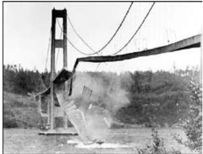
Figure 4. Tacoma Narrows bridge in Tacoma, Washington, 1940