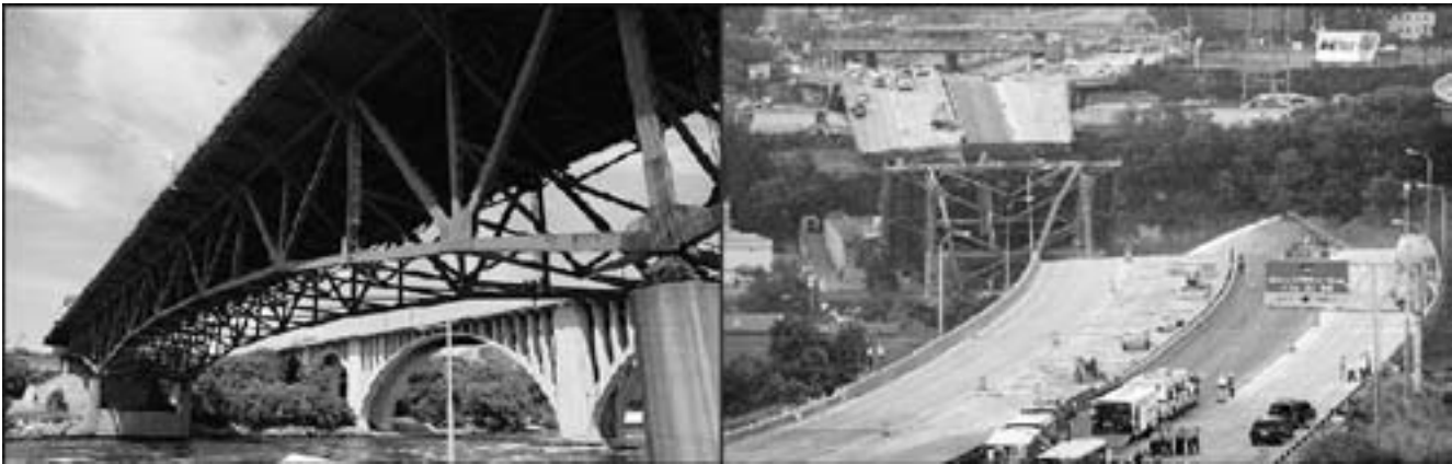
Figure 1. The I-35W Mississippi river bridge - Before and after failure